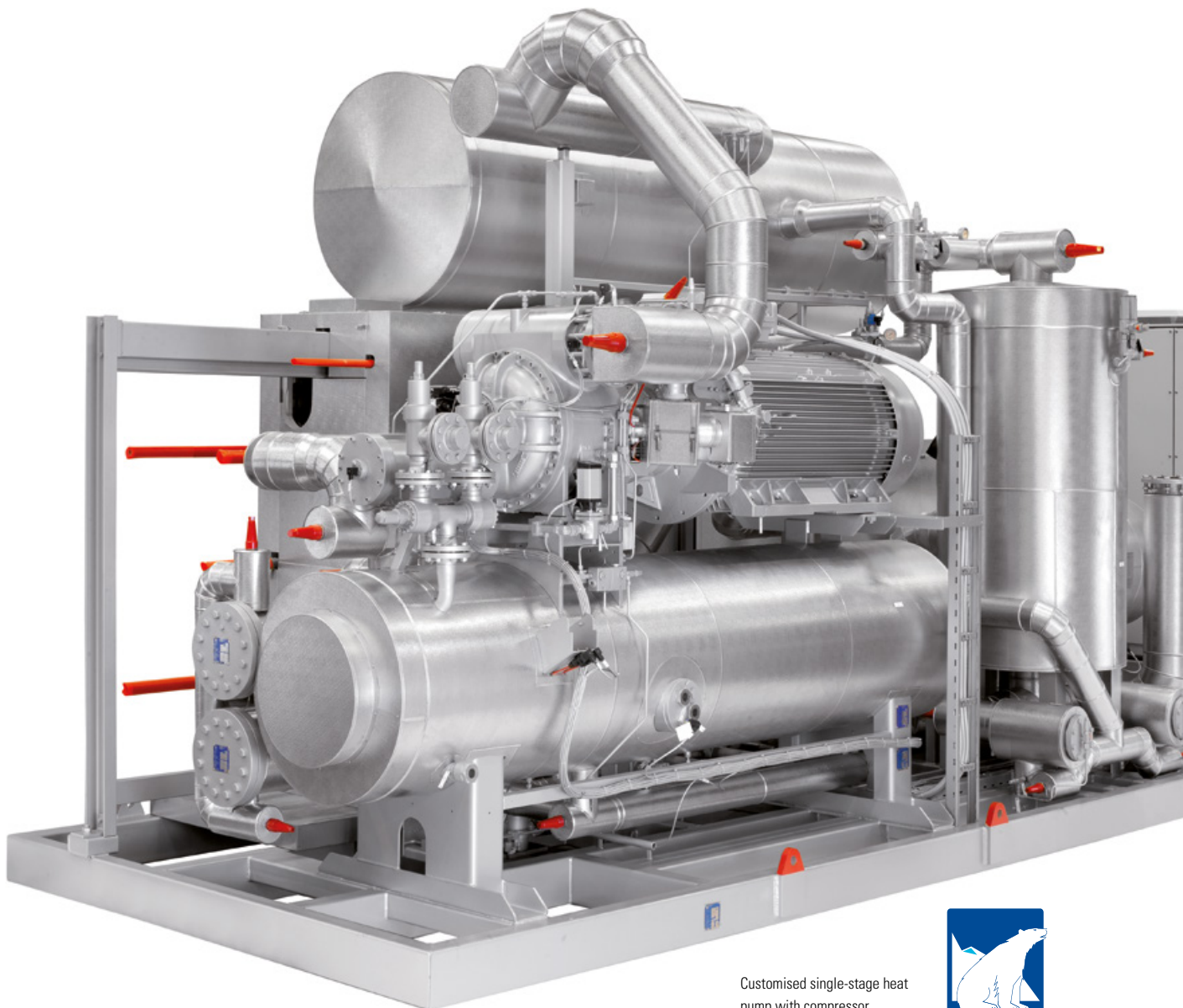
Customised single-stage heat pump with compressor

Sabroe industrial heat pumps use ammonia (R717) as refrigerant. Each unit is customised for the specific use and the particular installation, making sure that a minimum of thermal energy is used to provide maximum effect.