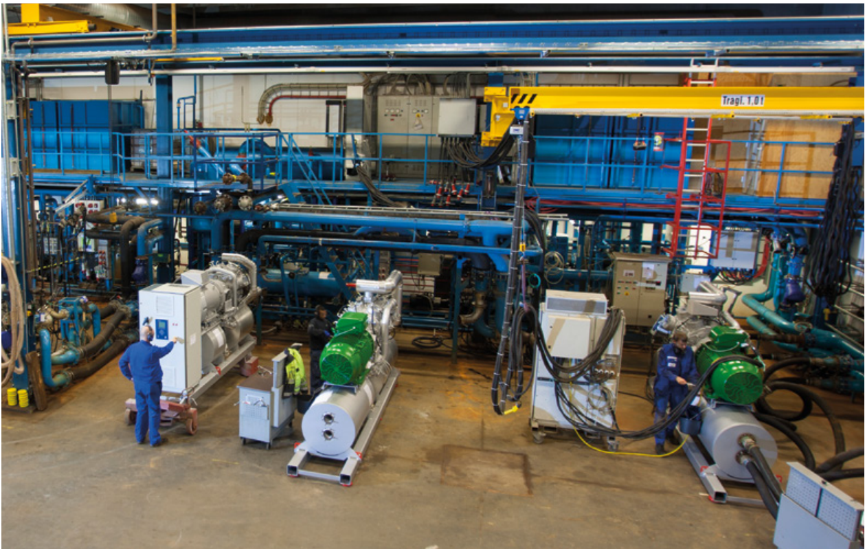
Test stands in the End-of-Line test centre

Solid, dependable documentation helps you and your technical staff plan effective implementation and integration with other equipment. And all the pre-delivery tests help save you time, money and hassle with commissioning and running in. With Sabroe product deliveries, you get what you ordered – and it works as you expected.