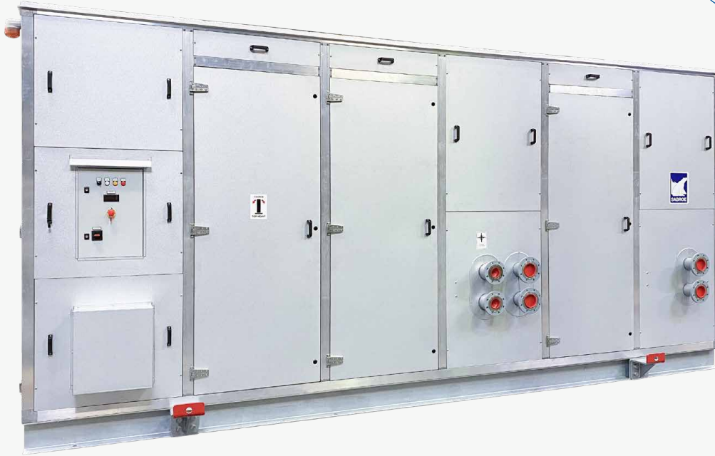
Sabroe enclosure for outdoor installation